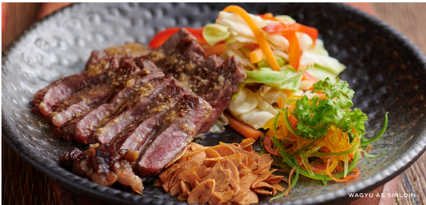
WAGYU A5 SIRLOIN