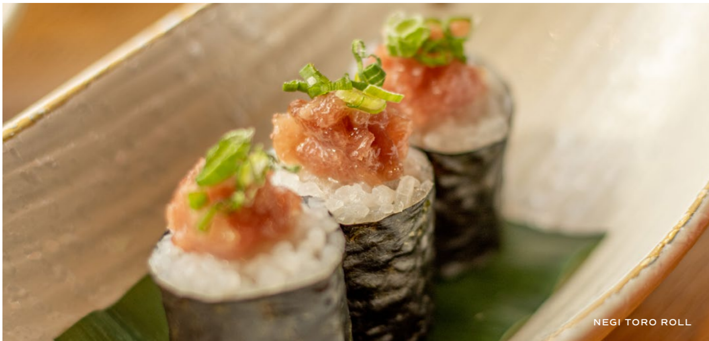
NEGI TORO ROLL