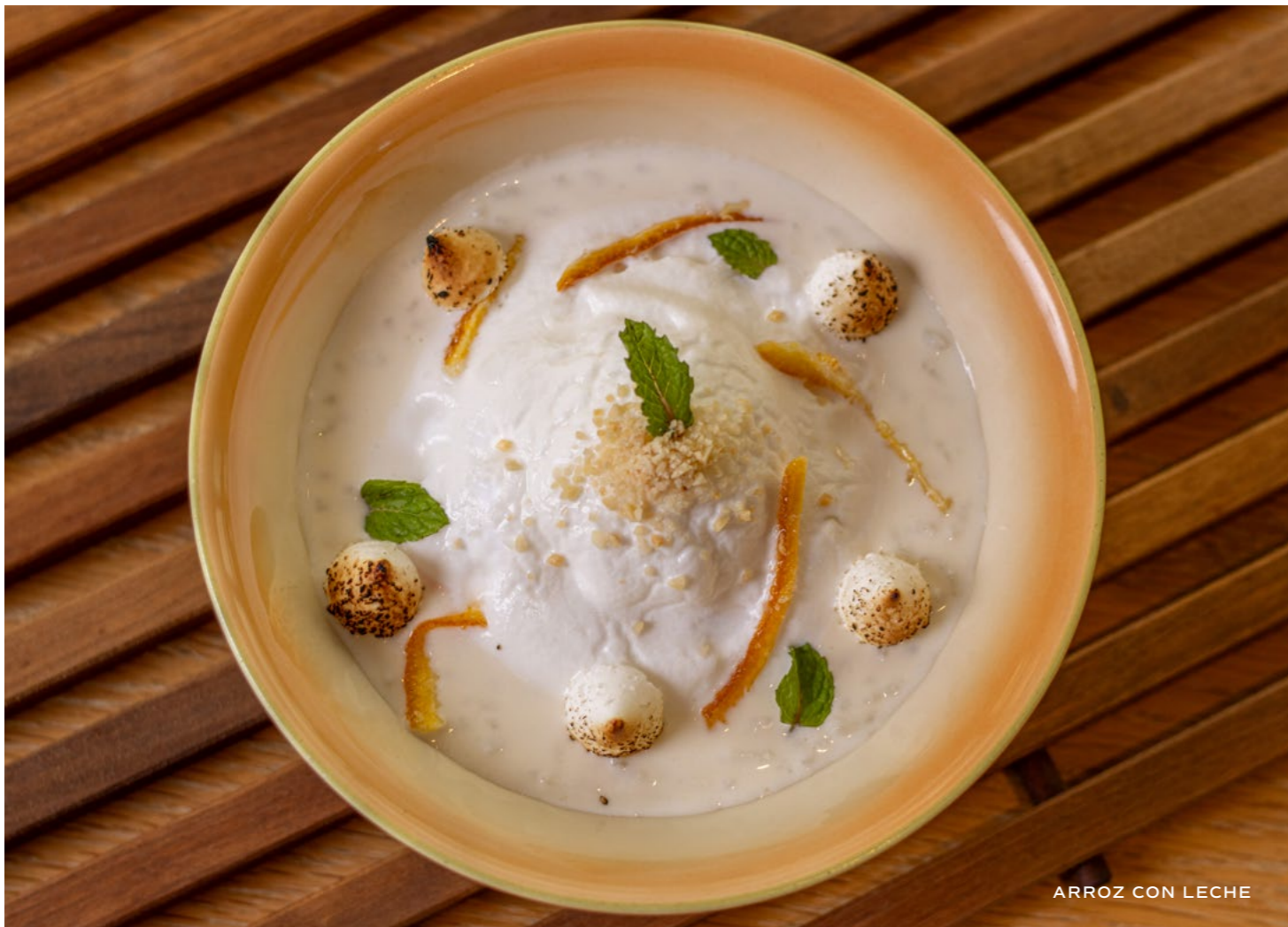
ARROZ CON LECHE